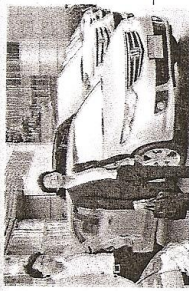
Honda profit halves, outlook brighter B16

THE BORNEO POST Wednesday October 28, 2009